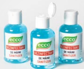
Farmol-Cid 50 ml, flip top cover

«Farmol-Cid» — is intended for hygienic and quick treatment of hands and cleansing of various surfaces of daily activity, in domestic conditions of increased hygiene, where disinfection is the basic measure to prevent spread of infections by cleaning the hands of medical staff: