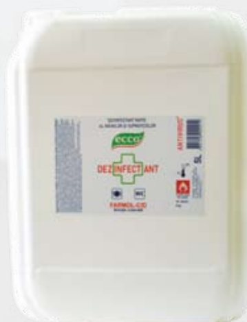
Farmol-Cid 5 L