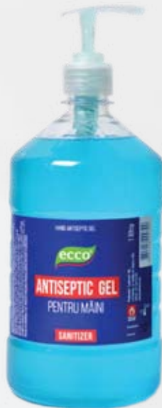
Hand sanitizer ECCO antiseptic gel, 1 L with dispenser