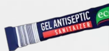
Hand sanitizer ECCO antiseptic gel, 3 g, single dose