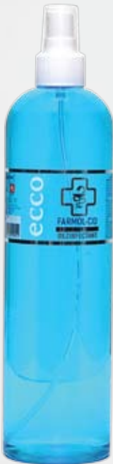
HOME Farmol-Cid 500 ml, Spray