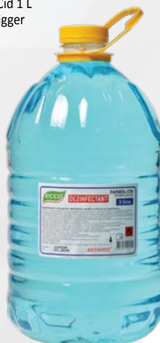
Farmol-Cid 5 L