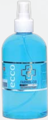
HOME Farmol-Cid 350 ml, Spray