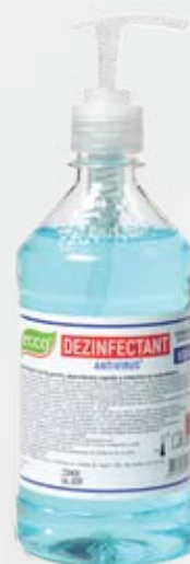
Farmol-Cid 500 ml with dispenser