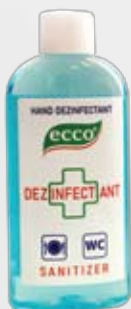
Farmol-Cid 100 ml