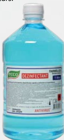
Farmol-Cid 1 L