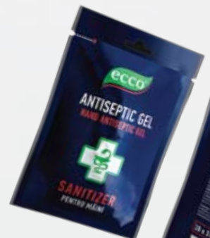
Hand sanitizer ECCO antiseptic gel, 20x3 g, single dose