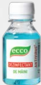
Farmol-Cid 100 ml