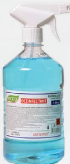
Farmol-Cid 1 L with trigger