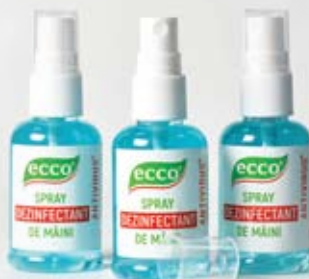
Farmol-Cid 50 ml, Spray