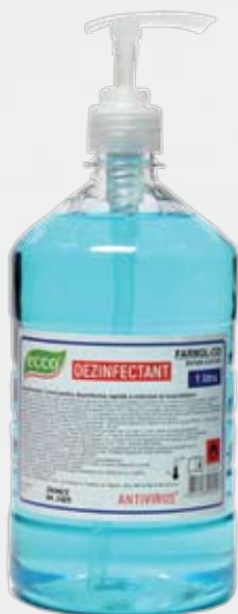
Farmol-Cid 1 L with dispenser