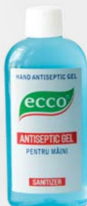
Hand sanitizer ECCO antiseptic gel, 100 ml