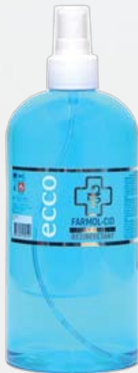
HOME Farmol-Cid 500 ml, Spray