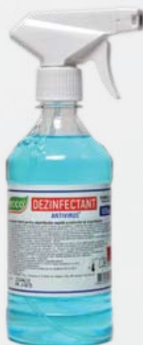
Farmol-Cid 500 ml with trigger