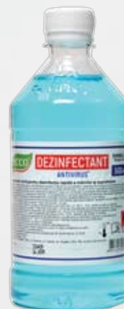
Farmol-Cid 500 ml