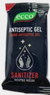
Hand sanitizer ECCO antiseptic gel, 35 g