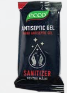
Hand sanitizer ECCO antiseptic gel, 35 g