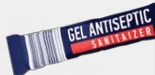
Hand sanitizer ECCO antiseptic gel, 3 g, single dose