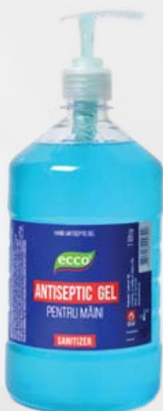
Hand sanitizer ECCO antiseptic gel, 1 L with dispenser