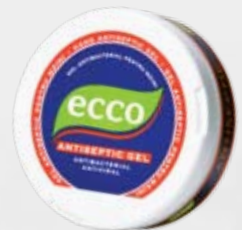
Hand sanitizer ECCO antiseptic gel, 35 g