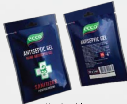
Hand sanitizer ECCO antiseptic gel, 50x3 g, single dose