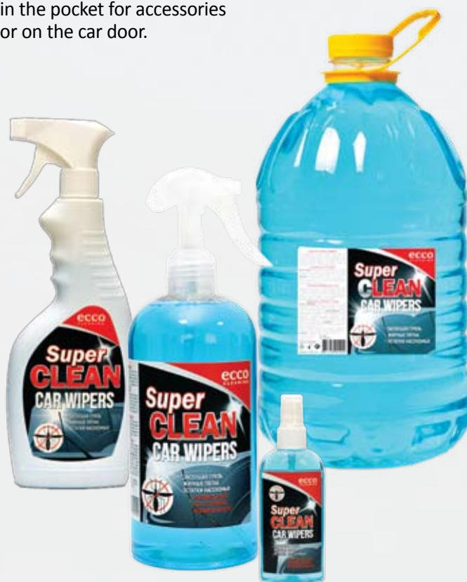
Car Glass Cleaner Spray ECCO CLEANING® 100 ml, 500 ml, 500 ml, 5 L

The compact form allows you to keep it close at hand - in the pocket for accessories or on the car door.