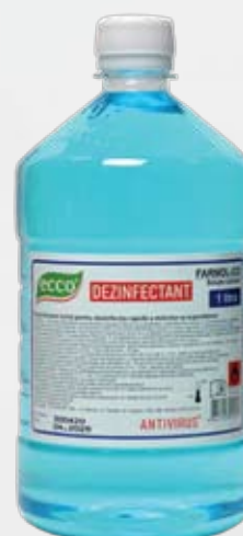
Farmol-Cid 1 L