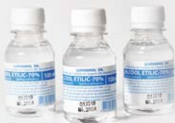
Ethylic alcohol 70 %, 100 ml, 1000 ml