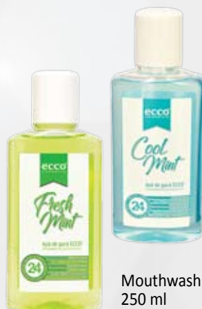
Mouthwash ECCO® 250 ml