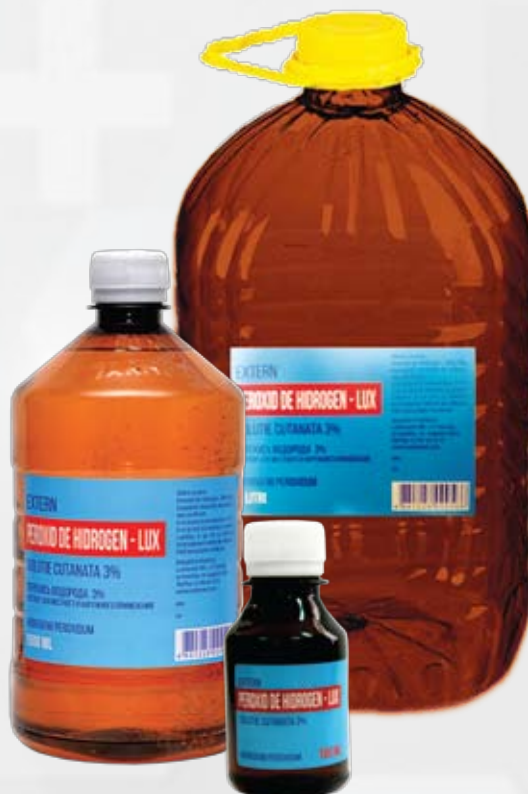
Hydrogen peroxide, 3% 100 ml, 1000 ml, 5 L