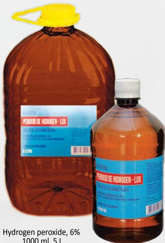
Hydrogen peroxide, 6% 1000 ml, 5 L

Hydrogen peroxide is used for surface treatment of wounds; to stop bleeding from small blood vessels (capillaries) with superficial wounds; nasal hemorrhage; mouthwash for stomatitis, tonsillitis, washing procedures to treat gynecological diseases.