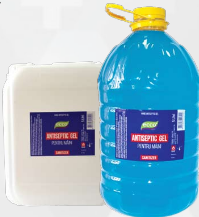
Hand sanitizer ECCO antiseptic gel, 5 L