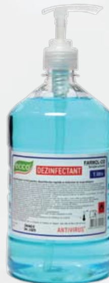
Farmol-Cid 1 L with dispenser