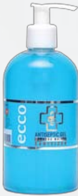
Hand sanitizer HOME antiseptic gel, 350 ml with dispenser