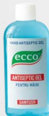
Hand sanitizer ECCO antiseptic gel, 100 ml