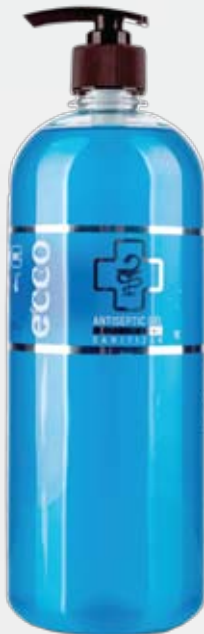
Hand sanitizer HOTEL antiseptic gel, 1 L with dispenser