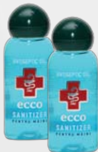
Hand sanitizer HOTEL antiseptic gel, 30 ml