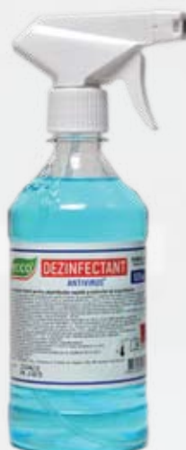
Farmol-Cid 500 ml with trigger