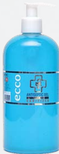
Hand sanitizer HOME antiseptic gel, 500 ml with dispenser