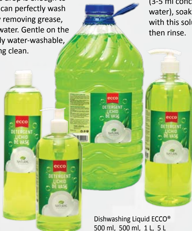
Dishwashing Liquid ECCO® 500 ml, 500 ml, 1 L, 5 L

Apply a small amount of the product on a sponge, foam it, wash the dishes with this foamy composition, then rinse with water. Or dilute the liquid with water (3-5 ml concentrated liquid + 1 liter of water), soak the dishes into a container with this solution, rub with a sponge, then rinse.