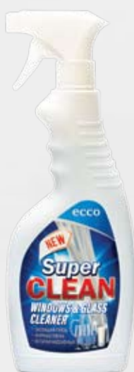
Glass and Glass Surface Cleaner Spray ECCO CLEANING®

Thanks to its unique formula, the glass cleaner spray visually smoothes scratches, making them less visible. It improves light reflection and, if regularly used, it improves light transmission. A visible effect may be observed, and cleanness and shine remain for a long time thanks to the formation of a protective cover against dust and dirt. It facilitates subsequent washing.