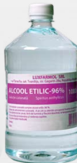
Ethylic alcohol 96 %, 100 ml, 1000 ml