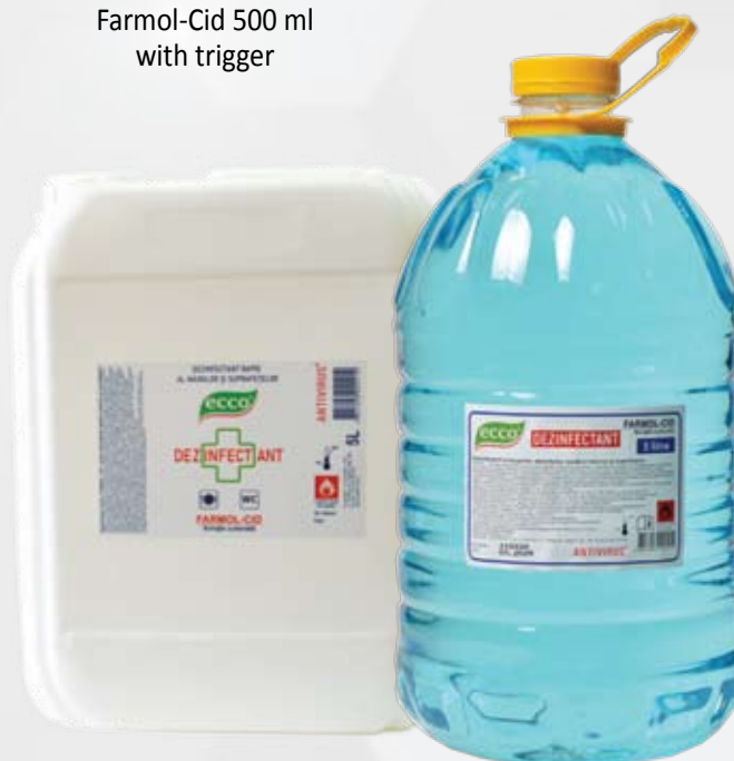
Farmol-Cid 5 L