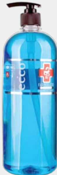
HOME Farmol-Cid 1 L with dispenser