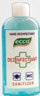
Farmol-Cid 100 ml

«Farmol-Cid» — is intended for hygienic and quick treatment of hands and cleansing of various surfaces of daily activity, in domestic conditions of increased hygiene, where disinfection is the basic measure to prevent spread of infections by cleaning the hands of medical staff: