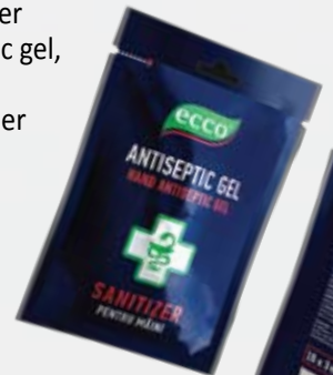
Hand sanitizer ECCO antiseptic gel, 20x3 g, single dose