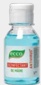
Farmol-Cid 100 ml, flip top cover

The sanitizer is a ready-to-use solution.