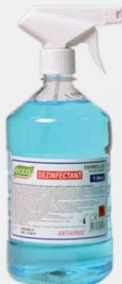
Farmol-Cid 1 L with trigger