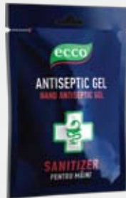
Hand sanitizer ECCO antiseptic gel, 10x3 g, single dose