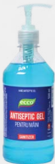
Hand sanitizer ECCO antiseptic gel, 500 ml with dispenser

The best gift for those you love is to show them you care! Take care of your loved ones with „Luxfarmol”