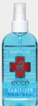
HOME Farmol-Cid 100 ml, Spray